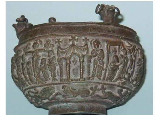
Censer from Takrit (7 th Century)