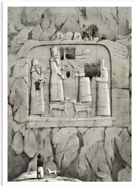
Cells dug inside Assyrian reliefs by Syrian ascetics fleeing Roman persecutions ca. 4 th century

Unravelling the Mysteries of the Ascetic Cells at Khinis, Northern Iraq