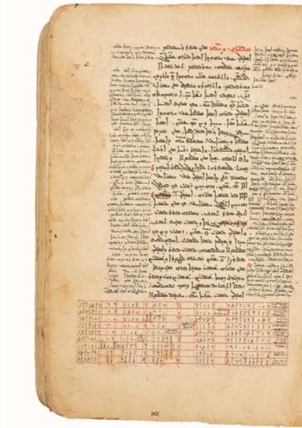
Page from the Chronicle of the Syrian Orthodox Patriarch Michael the Syrian

Crusaders, Turks, Greeks and Armenians, and the Syriac Orthodox in the Middle