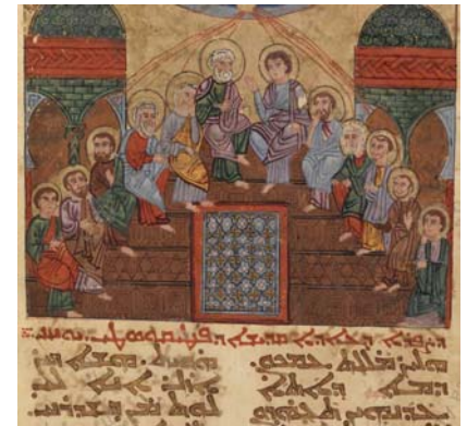
Scene of Pentecost in a Syriac Lectionary